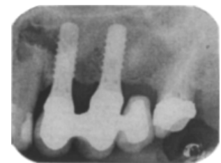
Fig. 4. RX of cantilever fixed prosthesis supported by Brånemark System® implants (Nobel Biocare, Göteborg, Sweden); last control.

1989a, 1989b; Benn 1990; Hausmann et al. 1991; Reddy et al. 1992; Weber et al. 1992; Esposito et al. 1993; Brägger 1994). A standardized protocol was performed. Highlighted parameters (cantilever length and MBL degree) was measured by juxta-gingival radiographs.