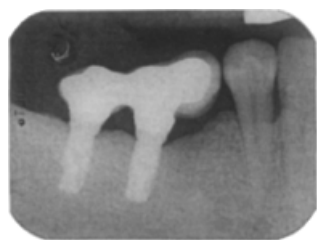
Fig. 2. RX of cantilever fixed prosthesis supported by ITI® implants (Institute Straumann, Waldenburg, Switzerland); last control.