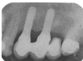
Fig. 3. RX of cantilever fixed prosthesis supported by Brånemark System® implants (Nobel Biocare, Göteborg, Sweden); 0 years-load.