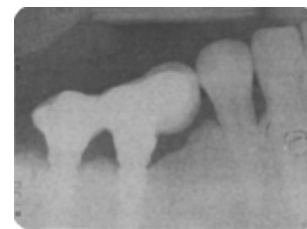
Fig. 1. RX of cantilever fixed prosthesis supported by ITI ® implants (Institute Straumann, Waldenburg, Switzerland); 0 years-load.

Juxta-gingival radiographs at time of first (0 years-loading) and at last evaluation (Figs 1, 2, 3 and 4) were considered for each implant-supported prosthesis. Performing juxta-gingival radiographs and loading them on a PC were considered with data found in literature (Eggen 1976; Lang & Hill 1977; Gröndal et al. 1984; Jeffcoat et al. 1984; Brägger 1988; Papapanou et al. 1988; Albandar 1989; Haussmann et al.