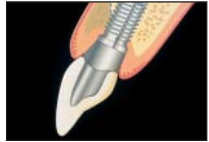
Fig 3a Ideal amount of bone needed to accommodate circumferential crater without loss of height in buccal mucosal margin; dotted line = original degree of buccolingual resorption of edentulous crest prior to bone augmentation.