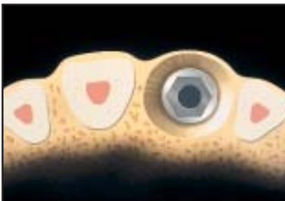
Fig 2b Thickness that bone on buccal side of implant should have to support gingival margin despite horizontal crater formation.