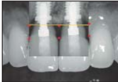
Fig 5d Superimposed radiographic and clinical images demonstrate relationship between bone and soft tissues and the presence of bone peak coronal to implants' shoulders despite the interimplant distance of about 3 mm.