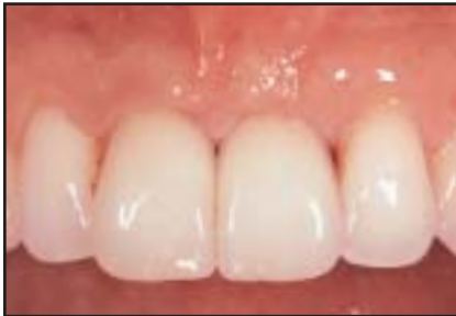
Fig 5c Clinical appearance of completed restorations 1 year after implant exposure.