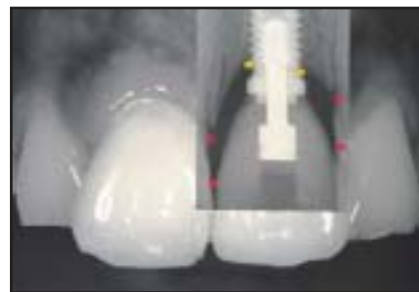
Fig 1b (right) Superimposed radiographic and clinical images of the same restoration demonstrate that the papilla is mainly determined by bone attachment on tooth side.