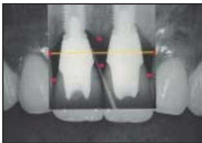
Fig 4b Radiographic (left) and clinical appearance (right) of completed restorations 1 year after implant exposure.