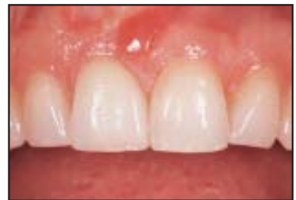
Fig 3c Clinical appearance of restored implant in right central incisor position 2 years after exposure.

If the distance between two implants is less than 3 mm, the interproximal bone level is expected to be more apical than the implant shoulder and therefore exhibit a reduced or nonexistent papilla. A distance of 3 mm between two implants will result in an interproximal bone height at most at the level of the implant shoulder. This situation (especially in highly scalloped cases) will still result in a deficit of the papilla because, in such cases, the implant shoulder is usually positioned more apical than the bone attachment of