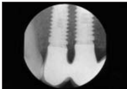
Fig 6 Four-mm-diameter abutment placed on 5-mm-diameter implant distances contaminated interface from bone; thus, degree of bone resorption is limited. Even if two implants are positioned close to each other, thanks to platform-switching concept, interproximal bone height is not reduced after 1 year.