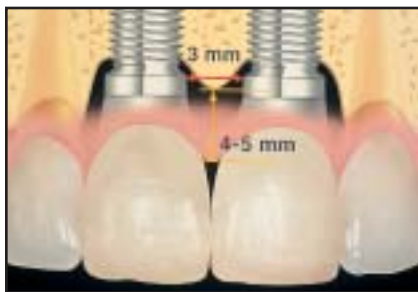
Fig 4a If the distance between two implants is only 3 mm, the interproximal bone level expected cannot be more coronal than the implant shoulder. Therefore, even in this situation, papilla will be reduced in height.