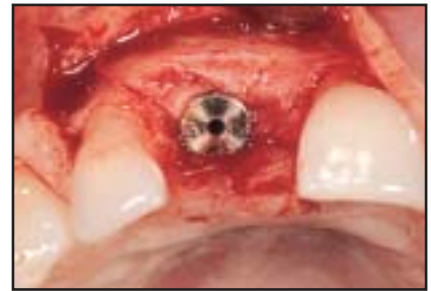
Fig 3b Original buccal bone profile at time of implant placement (left) and time of implant exposure (right) as a result of bone augmentation procedure carried out at stage-one surgery.