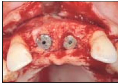
Fig 5b Distance between two 4-mm-diameter implants is about 3 mm, not enough to guarantee the presence of proper soft tissue papilla. Guided bone regeneration technique has been used to augment thickness of buccal bone across entire crest.