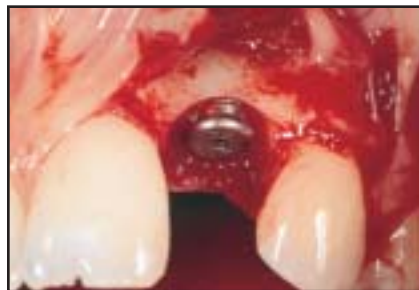
Fig 2a Circumferential crater around implant head demonstrates the formation of horizontal biologic width after 2 years of loading.