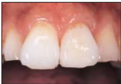
Fig 1a (left) Clinical appearance of papillae next to ideally placed single implant.